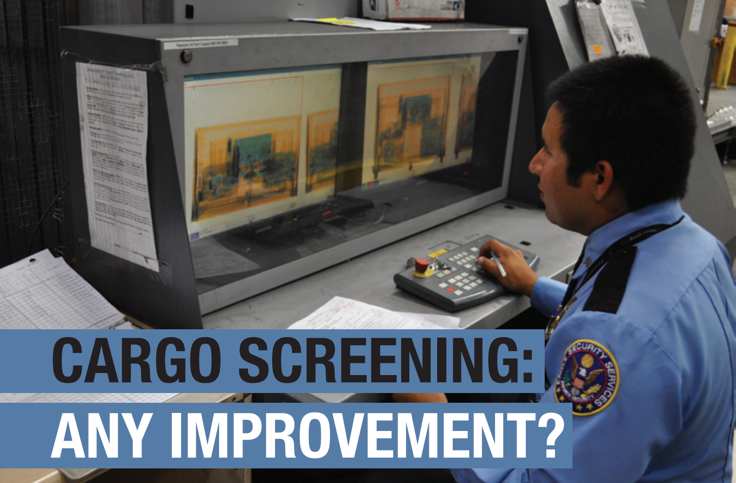
Cargo inspection